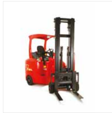
FLEXI NARROW AISLE