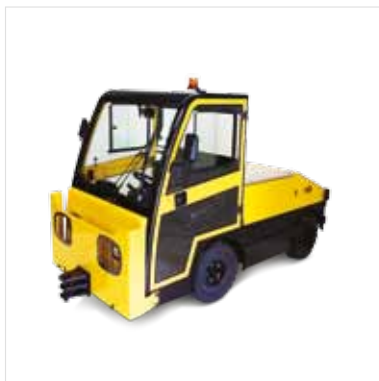
BRADSHAW ELECTRIC VEHICLES